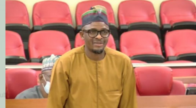
Speaking on the Executive Order signed by President Buhari in 2021 on financial autonomy of the legislature in every State

My experience in the Lagos State House of Assembly has been a learning curve and has enabled me discharge my duties accordingly ensuring I represent the interest of my constituents as well as seeing to the judicious use of State's resources. As the chairman of the House Committee on Economic Planning and Budget and with the leave of Mr Speaker & my Honourable Colleagues, I have superintended over several budget processes in the interest of the good people of Eti-Osa constituency 02 and Lagos State as a whole. This has immensely shaped the progress & prosperity being recorded in our dear State.