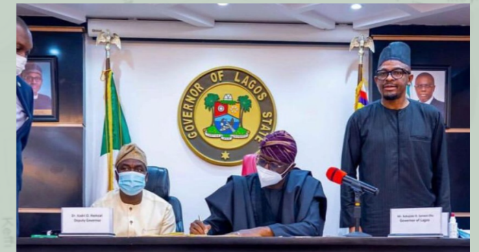
Signing of Appropriation Bill into Law by His Excellency Babajide Sanwo-Olu, Governor, Lagos State