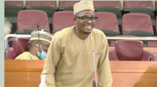
Speaking on creation of two new Universities in Lagos State.