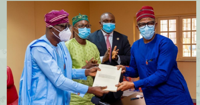
Presenting the Appropriation Bill on behalf of Mr. Speaker, Rt. Hon. Obasa to the Governor, Babajide Olushola Sanwo-Olu