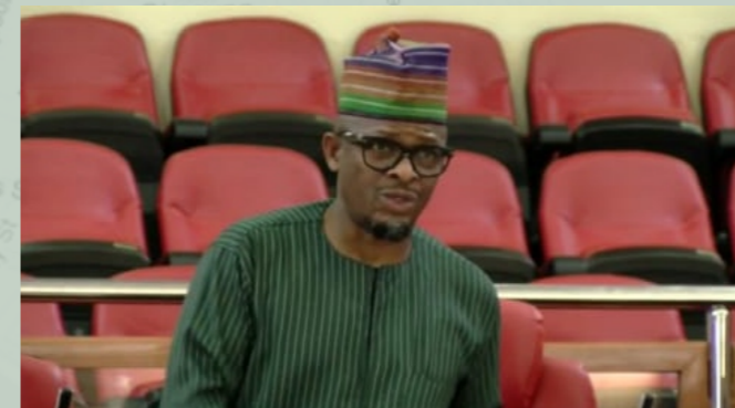
Debating the Constitutional Amendment transmitted by the National Assembly to State