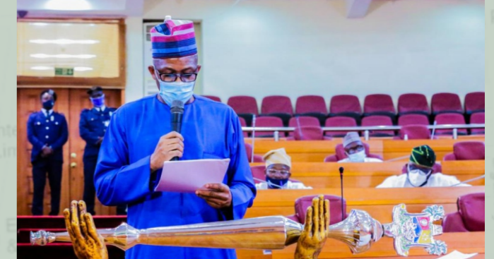
Laying of Appropriation report on the floor of Lagos State House of Assembly